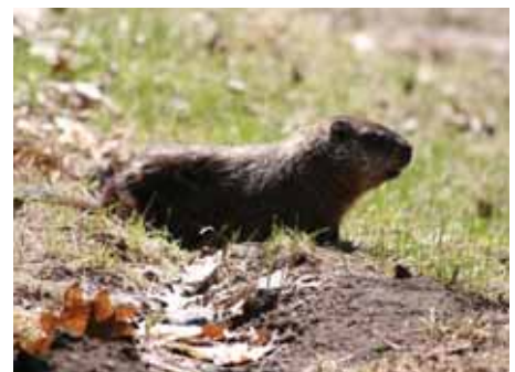
Stevie, the blind woodchuck.

Are the Loons going to return to raise another family? Will Stevie, LLCC's blind woodchuck return with the Spring? Watch the phenology on our website to find these answers and more. The Staff of LLCC wishes everyone to have a great summer of outdoor exploration and activity.