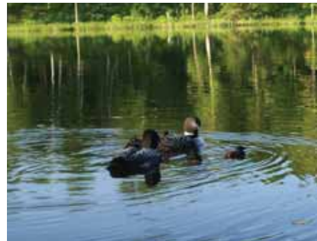
LLCC's Loon family. Summer of 2008.

CONSERVATION SMART NEWS... Email LLCC with your name and email address. A short email will be sent to you with a link to the newsletter each time a new one is ready, about 2-3 times a year. Save paper and postage... Conservation Smart News!!