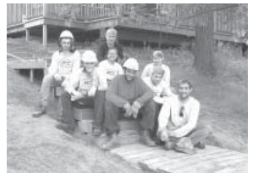
MCC youth volunteers sitting on the completed steps heading down to the lakeshore.

lake and bridges across some of the wetter areas of our trails. They deserve a hearty thank you for all the work they put in. These volunteers, and others like them, help to keep LLCC beautiful, safe,